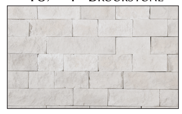
#189- Brookstone Blend