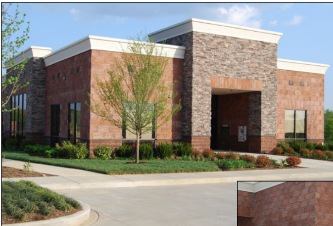
*special custom color shown

Normally square and rectangular shapes are most common in stone. Hence, different stone shapes tend to create different stone patterns. Furthermore, the installation of custom slate pieces blended into patterns, such as Centurion's Biltmore, Castlerock & Running Bond, have contributed to the popularity of these patterns in both interior and exterior applications. The ability to incorporate these strong and durable stone pieces into various patterns explain why the design is rapidly increasing.