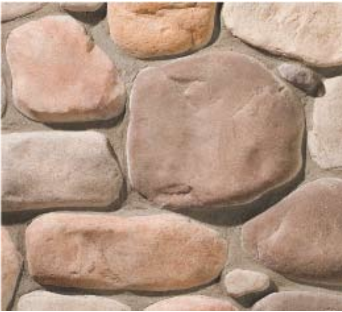
Desert River Rock #08036025