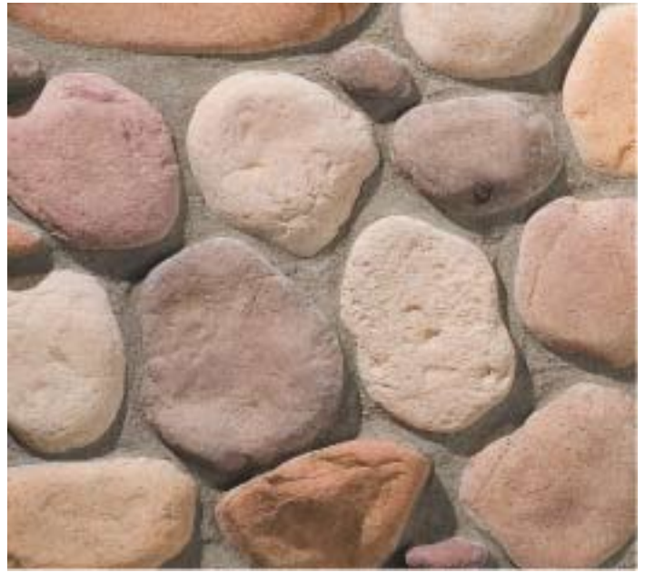
Valley Brook River Rock #08071925

Drawn By: Centurion Stone Date: Revised: Scale: NOT TO SCALE Checked by: Sheet: 1 of 1