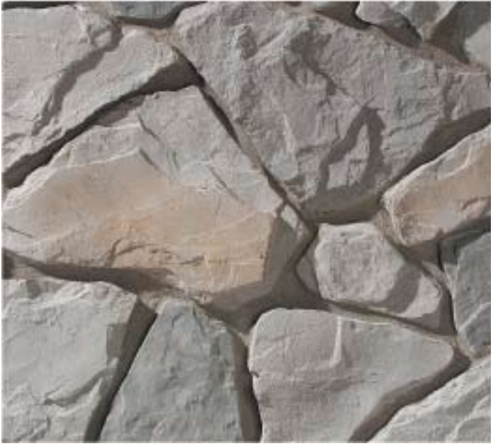
Gray Palos Verde #04003045