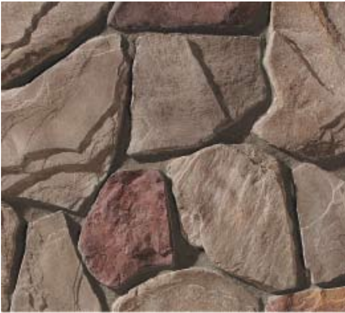
Pennsylvania Palos Verde #04080025

Drawn By: Centurion Stone Date: Revised: Scale: NOT TO SCALE Checked by: Sheet: 1 of 1