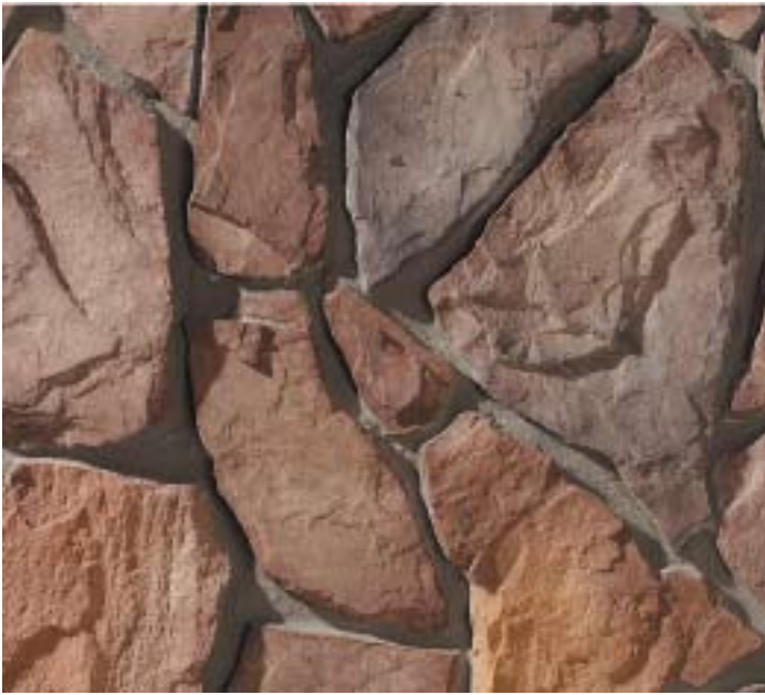
Arkansas Palos Verde #04017065