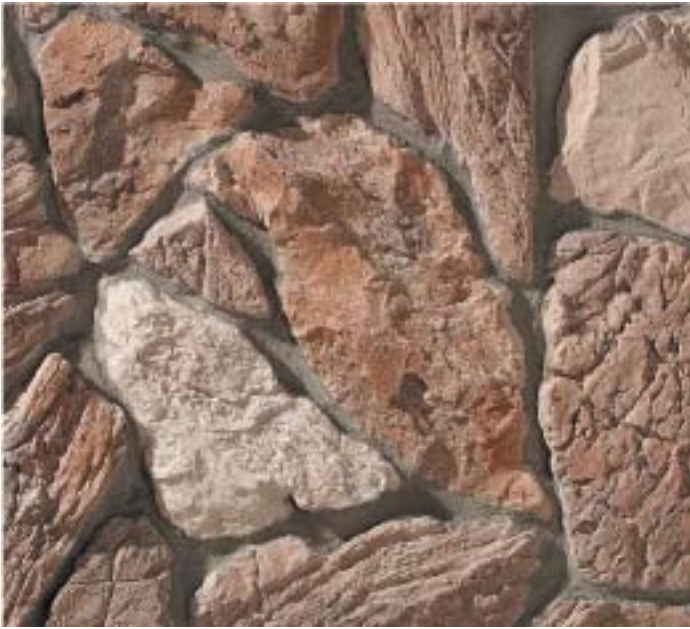
California Driftstone #03022025

Drawn By: Centurion Stone Date: Revised: Scale: NOT TO SCALE Checked by: Sheet: 1 of 1