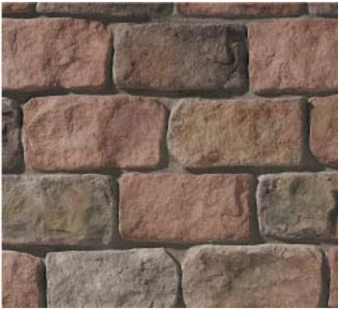
English Cobblestone #18027015

Drawn By: Centurion Stone Date: Revised: Scale: NOT TO SCALE Checked by: Sheet: 1 of 1