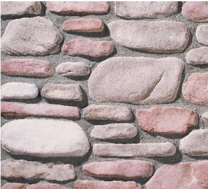
Oakleaf Bedrock #09524010