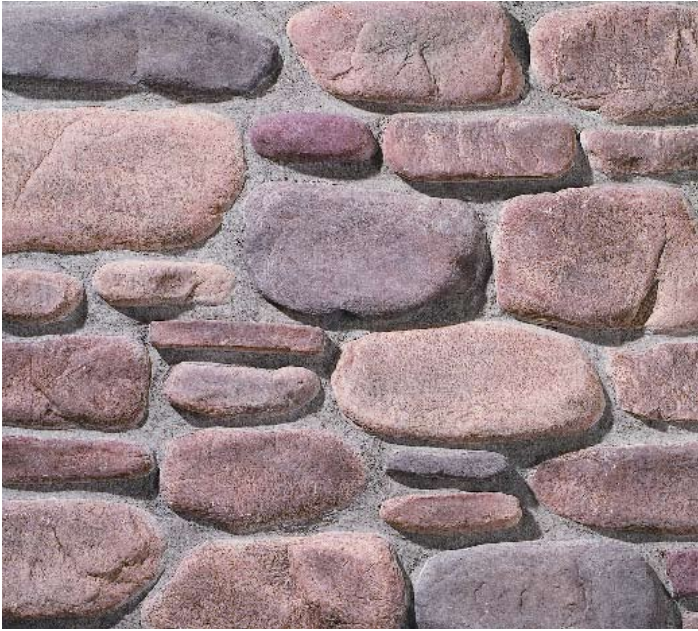
Suede Bedrock #09518565

Drawn By: Centurion Stone Date: Revised: Scale: NOT TO SCALE Checked by: Sheet: 1 of 1